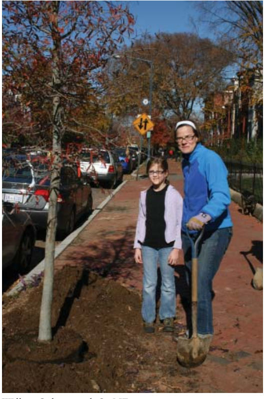
Willow Oak on 12th St. NE