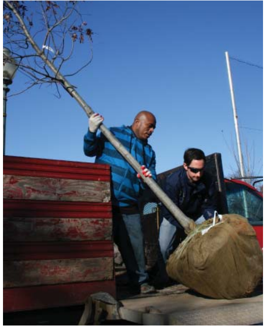
The men of Merrifield unload first tree

A sourwood ( Oxydendrum arboretum ) and a male ginkgo ( Ginkgo bilob a) were planted in the 1400 block of North Carolina and a red horse chestnut ( Aesculus x carnea 'Fort McNair ) in the nearby park. This hybrid specimen brings together the best of its parents, the buckeye and the horse chestnut. These trees are in the same family, sharing a similar leaf