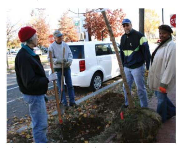
Chinese pistache at 15th St. and Constitution Ave. NE