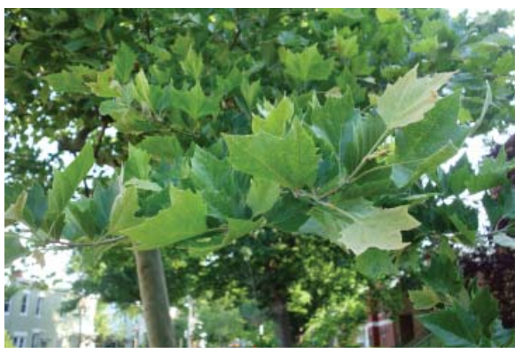
Healthy leaves on uninfected specimen

What can be done? At this point in time, nothing! Infections have already occurred, and the damage is done. Infected sycamores will develop new foliage later this spring to take the place of the initial growth lost to anthracnose, and temperatures will be warmer and therefore unfavorable for disease development on this new growth.