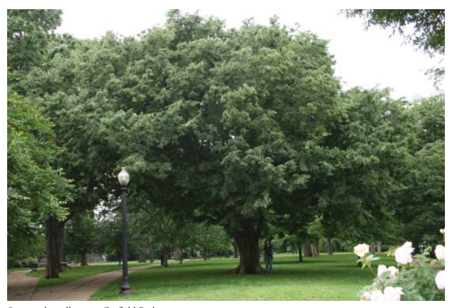
Spectacular zelkova in Garfield Park

A few years back, a Schenectady NY official with oversight of that city's street trees visited the District and was equally impressed with the zelkova's vigor and non-fussiness and has since added them to his planting list.