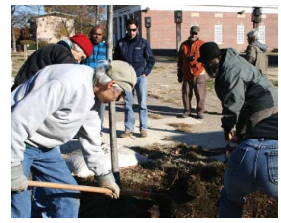
Scarlet oak, 13th St. SE