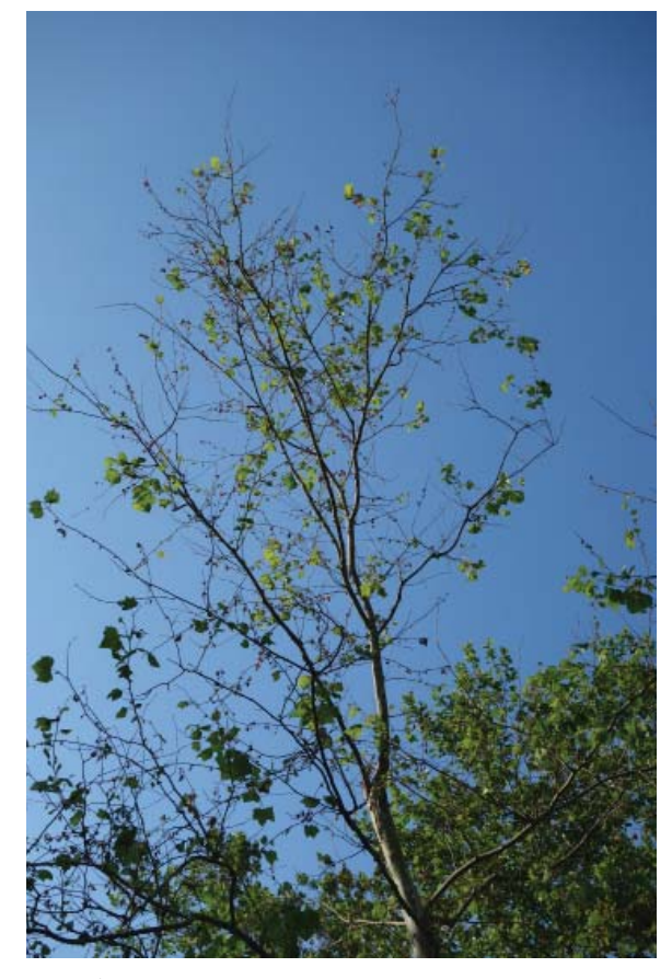
Poor sick Sycamore