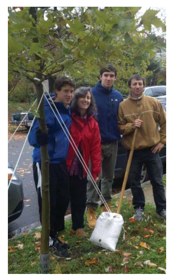
Good as New—a total team effort

These neighbors on the 100 block of 13th St. NE were completely committed to the seedless sweetgum they planted in the fall of 2011 and look at it at the end of last summer! Not a speck of drought damage anywhere and it's grown by leaps and bounds. There's no magic required, just add water!