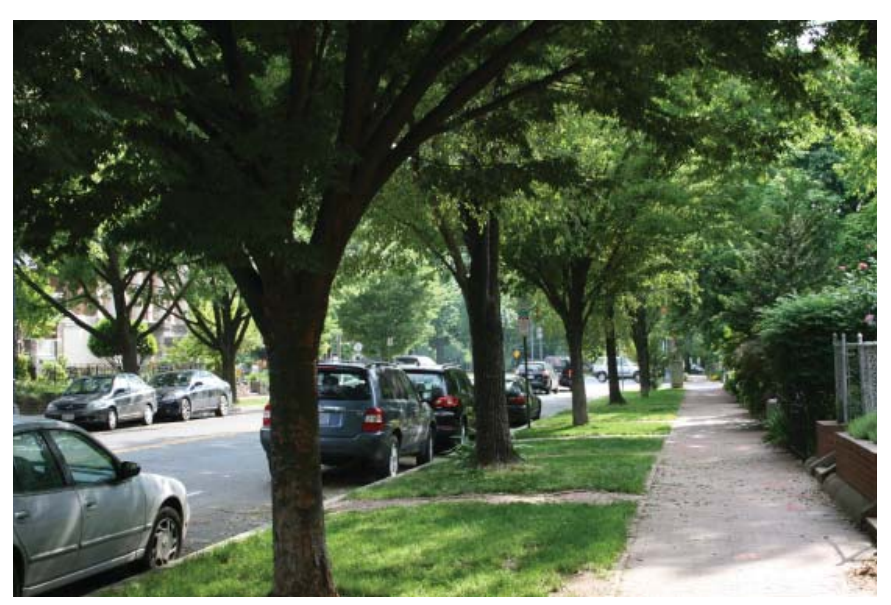
Mixed row of zelkovas and elms planted by TFCH in early 1990's