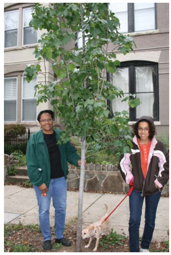
The results of lavish watering