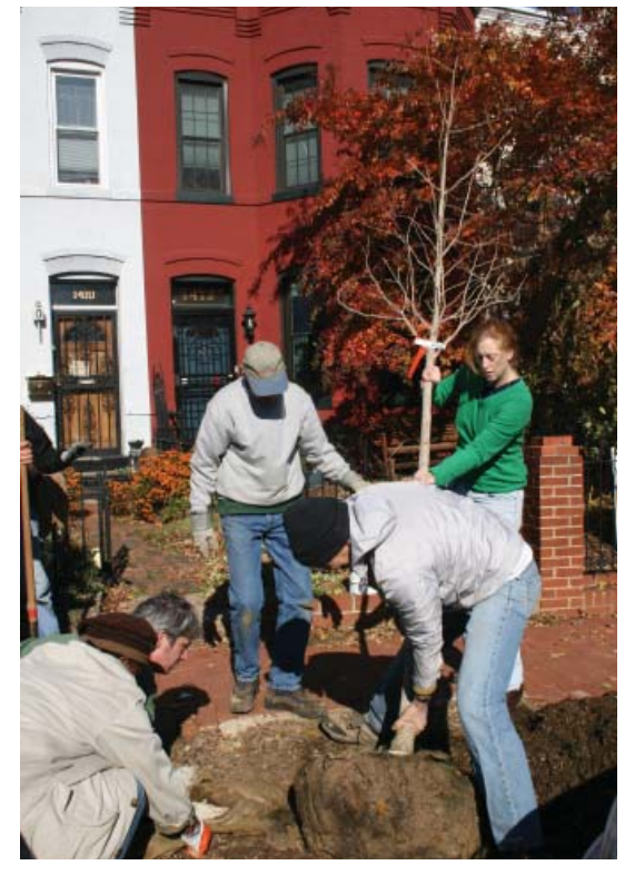
Ginkgo, 1400 block North Carolina Ave. NE