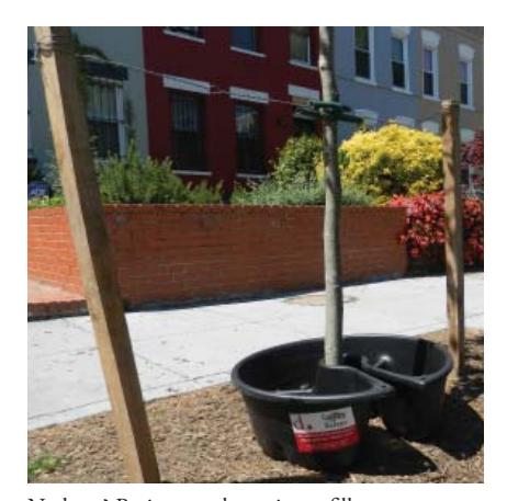
No hose? Basins may be easier to fill