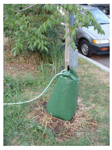
Treegators are easiest to fill by hose

District Department of Transportation 55 M Street, SE, Suite 600 Washington, DC 20003 202 673-6813 Service requests can be made on dc.gov or by calling 311.