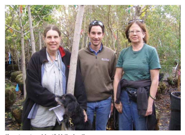
Shopping trip to Merrifield Garden Center