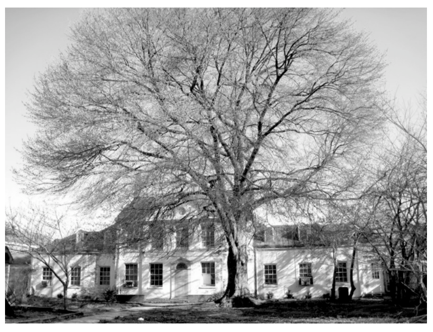
Water oak at Friendship House, 600 block South Carolina, Ave. SE.

Restoration and development of the Friendship House property could threaten our Tree of the Year in 2002, the water oak located on the South Carolina side of the house. The Friendship House Association moved out of the building in 2008 after filling for bankruptcy. Altus Realty Partners purchased the property in March 2010 and will restore the exterior. Plans to convert the property to residential use are still being developed.