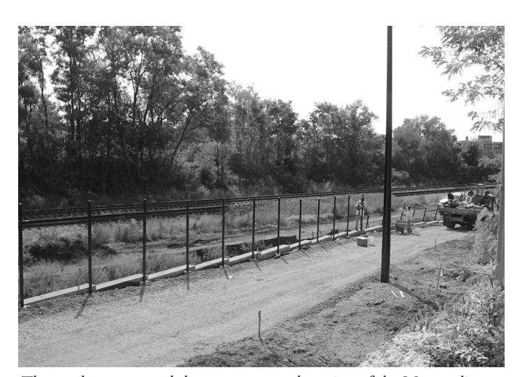
The newly-constructed, but not yet paved, section of the Metropolitan Branch Trail between New York Ave. NE and Franklin Street, NE.

novel approach to watering these and other trees around the city with Casey Trees Water By-Cycle, which utilizes bicycle carts equipped with long hoses and access to water from fire hydrants — a green (and more efficient) approach to reach trees with limited parking, fulfilling an essential task for our green city.