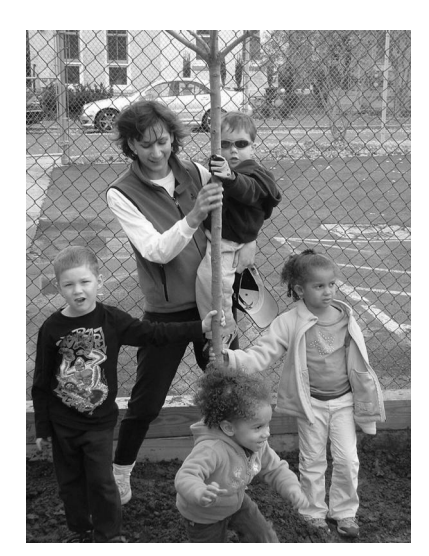
Maury students promise to love, water and protect their new tree.

cluding the impressive dawn redwood across the Street from 1364 Constitution Ave. NE and it's dainty neighbor, the Chinese fringe tree, a half a block east at 1402 Constitution Ave.